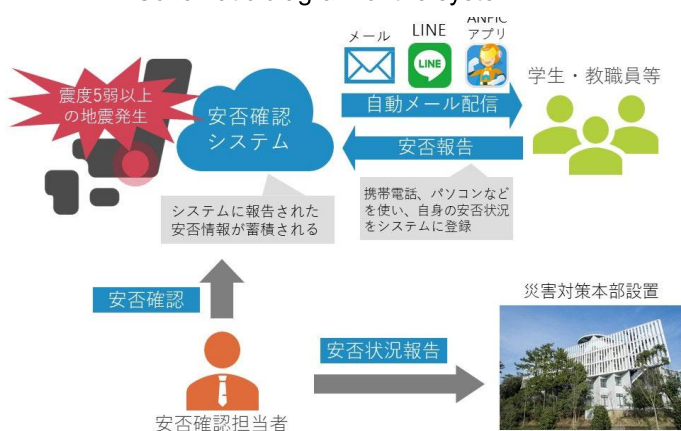
<Schematic diagram of the system>